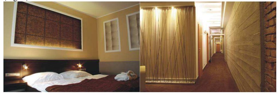
Fig. 5. Interior of hotel room following modernization (on the left), hotel corridor on the right

The modernization of the hotel which took place during the years 2011-2012 (authors Uherek-Bradecka, Tomasz Bradecki) was aimed at providing the interior with new, original esthetics, increasing the standard and adapting the hotel to a 4-star standard. Due to the fact that this involved an already existing building and the possibilities of its adaptation were somewhat limited (development in the immediate city center, stairwell and elevation subjected to historical preservation maintenance (see Fig. 5)), it was possible to meet the categorization requirements despite the fact that not all requirements set out for newly-constructed buildings were fulfilled (1,2). Original bricks (as had been done previously) were left in the corridors of the hotel as a finishing element, whereas the walls of some other parts of corridors were finished with a coating of raw concrete (Fig. 5). The hotel rooms anticipated a solution which brought about associations with the historical past: wallpapers finished with decorative profiles, the same as those used in the past to create ornamental moldings (Fig. 5).