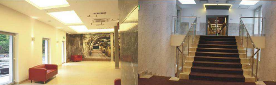
Fig. 3. The inside of Hotel Diament in Zabrze on the left - the hotel lobby with a fragment of an image of the nearby Guido mine, on the right - the exhibited representative stairwell

During the renovation of the hotel building in Zabrze, particular attention was given to interior design. Inside, some elements of design were to reflect local traditions: elements of clinker brick as wall cladding were used, as well as photographs of important buildings and public use facilities located in the direct neighborhood of the hotel (Fig. 3). As written by Jeonglyeol Lee (7), the design of the hotel ought to consider its location and use it as an attribute and advertisement, emphasizing the area in which it is located. This can have an influence on better economic results of the building serving such a function. Work on the hotel involved not only architects, but also specialists in marketing, advertising and PR. Thanks to this, attention was paid to make the interiors consistent in appearance and create an "atmosphere" of hospitality, which can be effective in shaping the success of a given place, as it is of significant importance to the guests (5).