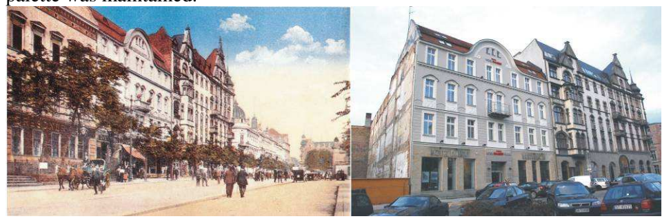
Fig. 4. Hotel Diament in Katowice next to Dworcowa Street - historic photo and state following renovation

significantly from the prototype: the stucco work was retained, a soft light color palette was maintained.